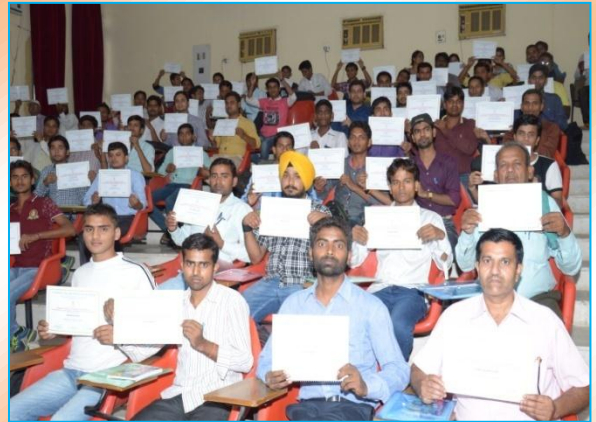
Participants during “Skill Development Programme” at NSI, Kanpur