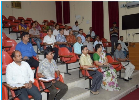
हिन्दी कार्यशाला दिनांक 19.06.2015

उन्होंने संस्थान के अधिकारियों एवं कर्मचारियों को हिन्दी के अधिकाधिक प्रयोग करने हेतु आवाहन किया जिससे कि संस्थान में हिन्दी में कार्य करने का लक्ष्य हासिल किया जा सके।