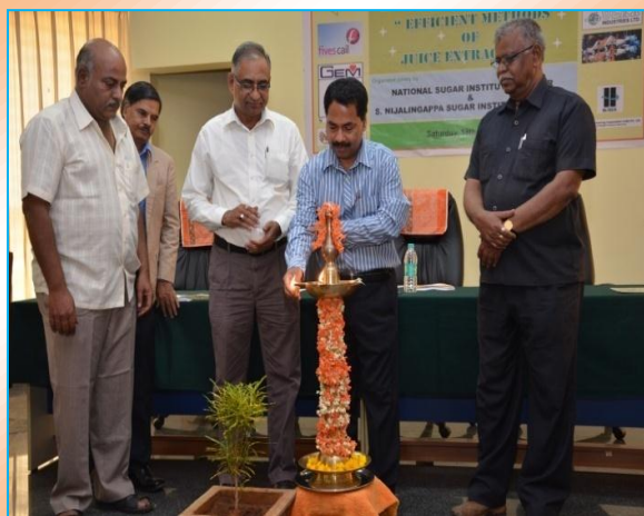
All India Seminar Organized by NSI and SNSI at Belagavi, Karnataka on 18 th April, 2015.

During the seminar nine papers were presented. The Presentations covered different methods used for energy conservation, energy saving potentials and energy efficient juice extraction technologies developed and in use. Use of energy efficient proven technologies viz. Trash plate less mills and Diffusers so as to reduce power requirement during juice extraction were deliberated in detail. The theme of seminar focused on energy savings during juice extraction so as to enhance power exports.