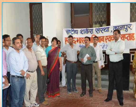
Swachh Bharat Mission Campaign

The main building, hostels, Experimental Sugar Factory and residential buildings were cleaned with no surplus materials lying here and there. During the campaign unserviceable material was also identified & action was taken for its disposal.