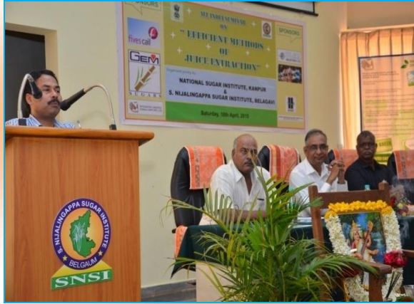
All India Seminar Organized by Organized by NSI and SNSI at Belagavi, Karnataka on 18 th April, 2015.