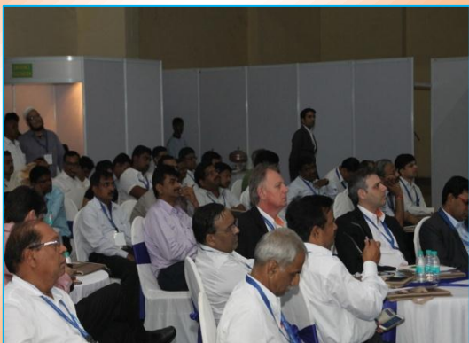
7 th Sugar Asia held on 22 nd May, 2015 at Mumbai