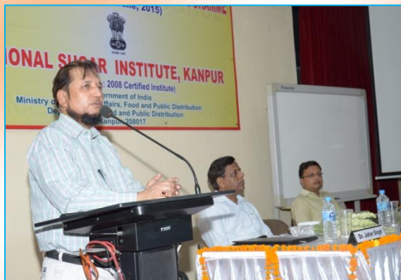
Inaugural address by Commissioner Kanpur Division

The Institute organized five days Training cum Skill Development Programme on “ Maintenance of Machinery & Equipment in Sugar Factories ” from 22 nd -26 th June, 2015. This training programme was designed to develop the skills of students of ITI / Metric Passed/ employed unskilled workers with respect to cost effective maintenance of machinery & equipment in a sugar factory so as to have minimum breakdowns.