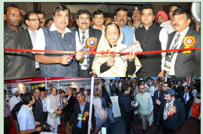
Snapshots of the International Expos held previously