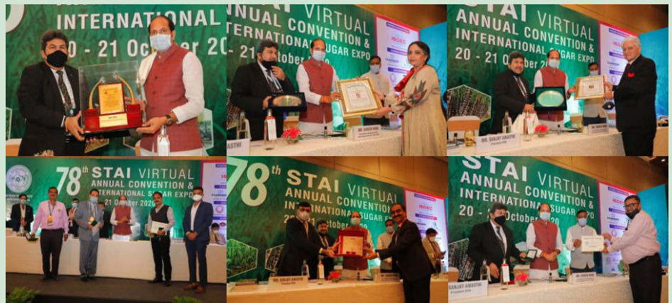
Snapshots of the award presentation ceremony during STAI Annual Convention 2020