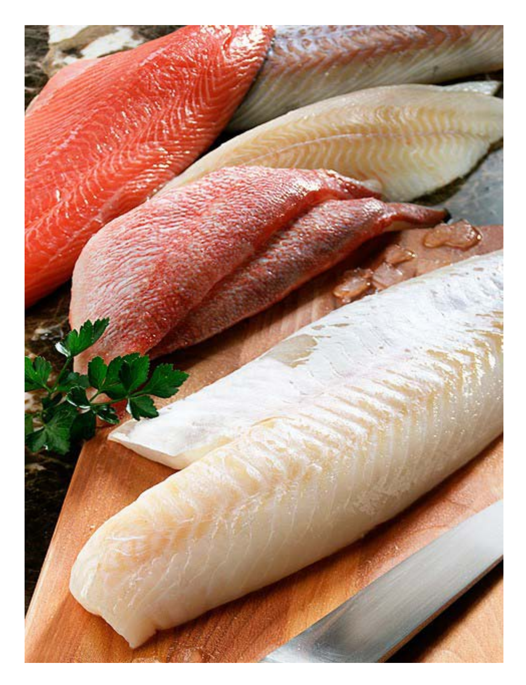
Prevent PMS with yogurt

look for oily fish like salmon, sardines, tuna, mackerel, trout and herring.