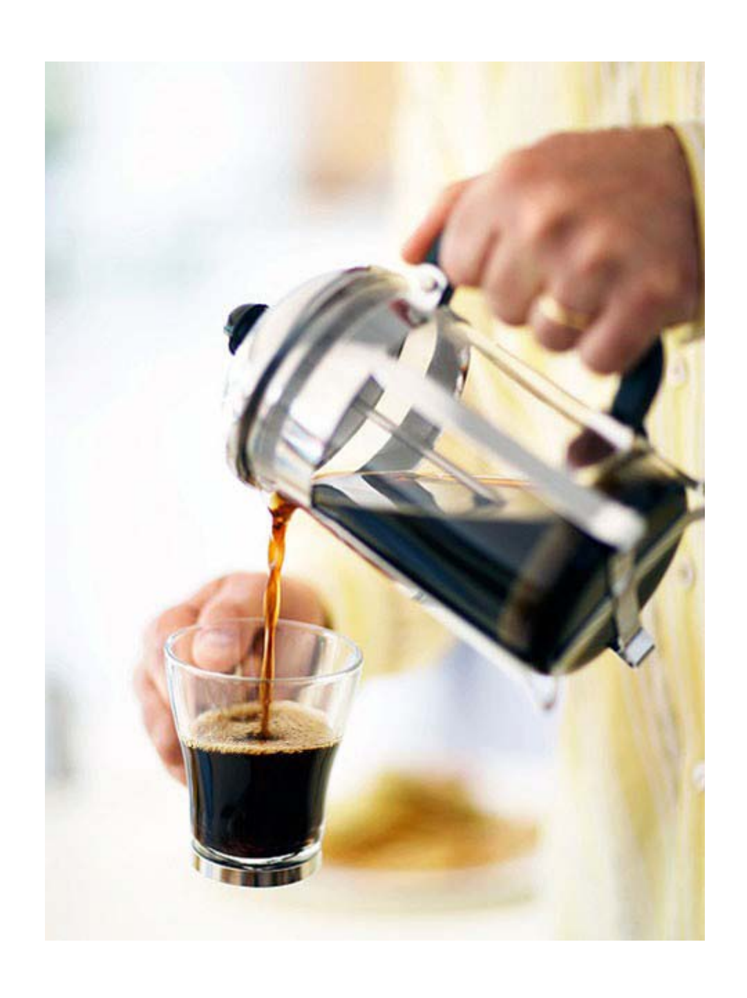
Tame leg cramps with tomato juice

At least one in five people regularly struggle with leg cramps. The culprit? Potassium deficiencies, which occur when this mineral is flushed out by diuretics, caffeinated beverages or heavy perspiration during exercise. But sip 10 ounces of potassium-rich tomato juice daily and you'll not only speed your recovery, you'll reduce your risk of painful cramp flare-ups in as little as 10 days, say UCLA